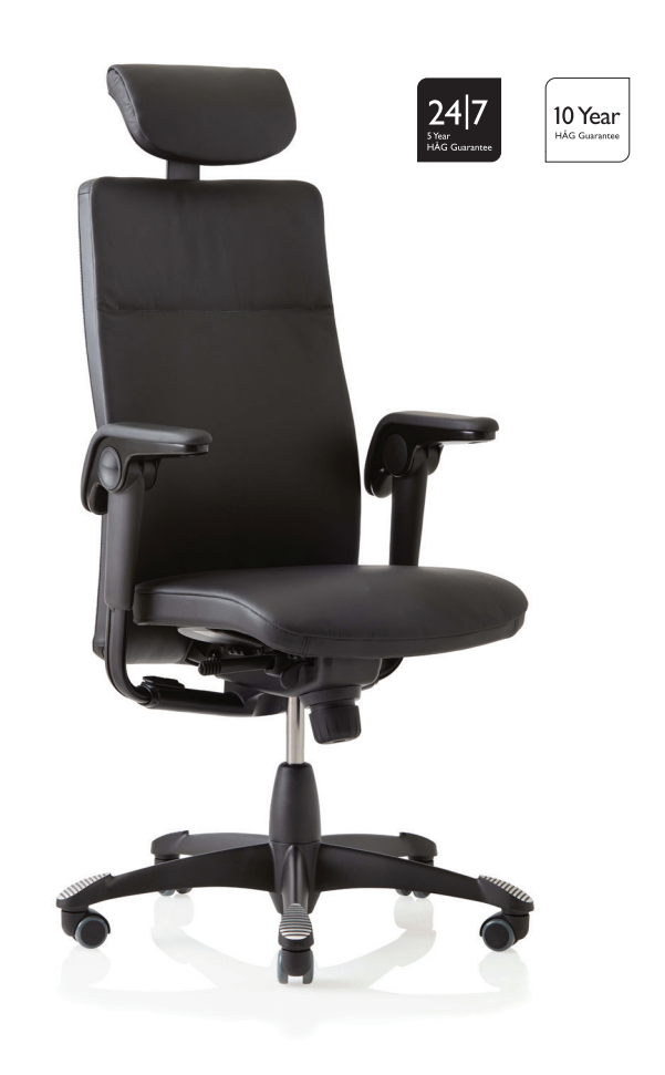
Design: Svein Asbjørnsen/sapDesign®. Patent- and design protected.